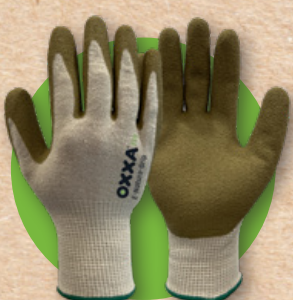
E-NATURE-GRIP 52-000 Art. no. 1.52.000.00

TESTING INSTITUTE These gloves are certified by: CTC (Notified Body no. 0075), 4 Rue Hermann Frenkel 69367 Lyon, Cedex 07, France. For a copy of the declaration of conformity, we refer you to the following link: www.oxxa.work/doc