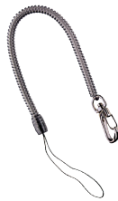
A42001-9 Clip-on Coil Lanyard