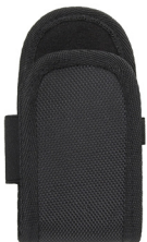
A41014-7 Universal Safety Knife Fabric Holster